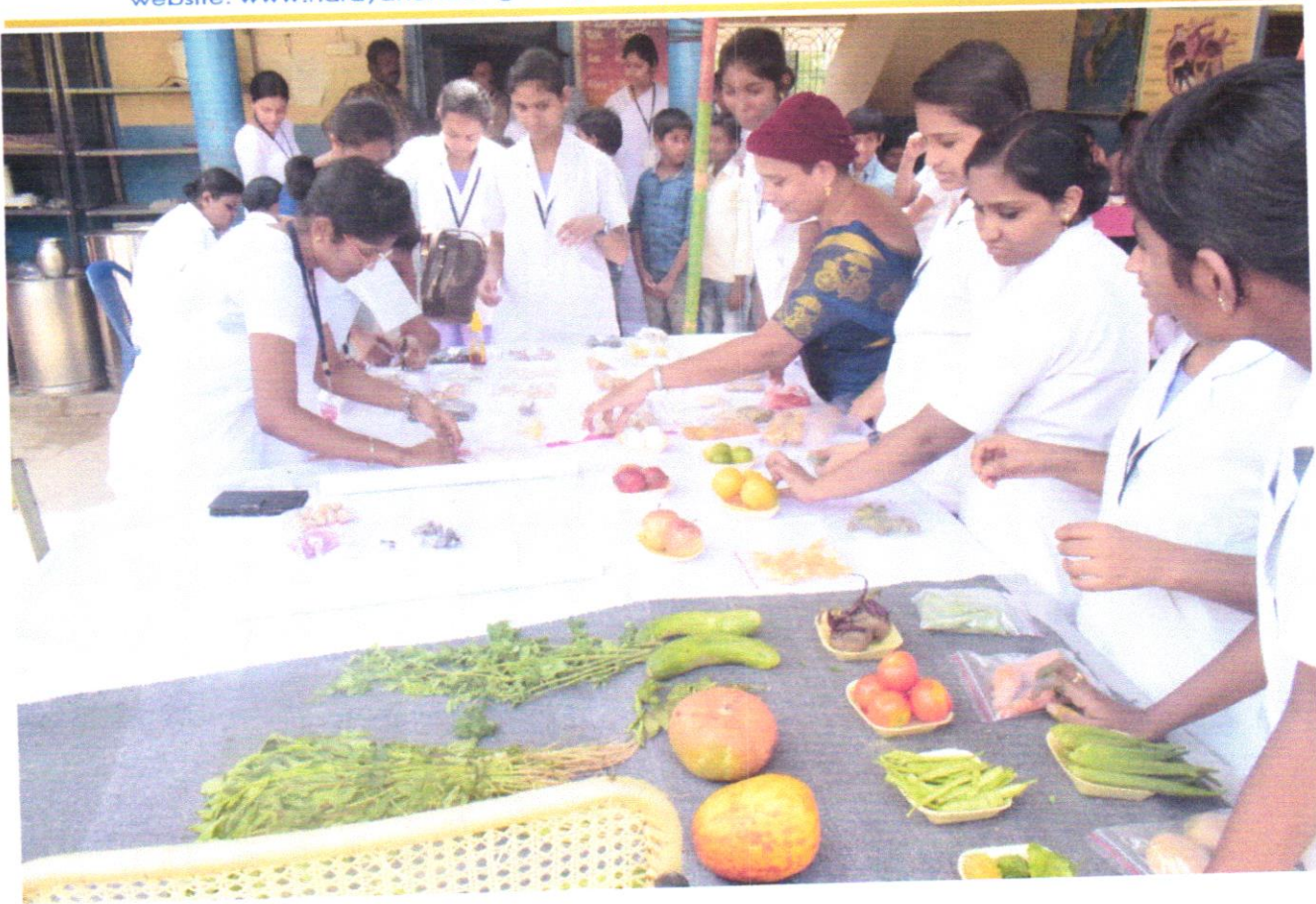
Nutritional awareness activity