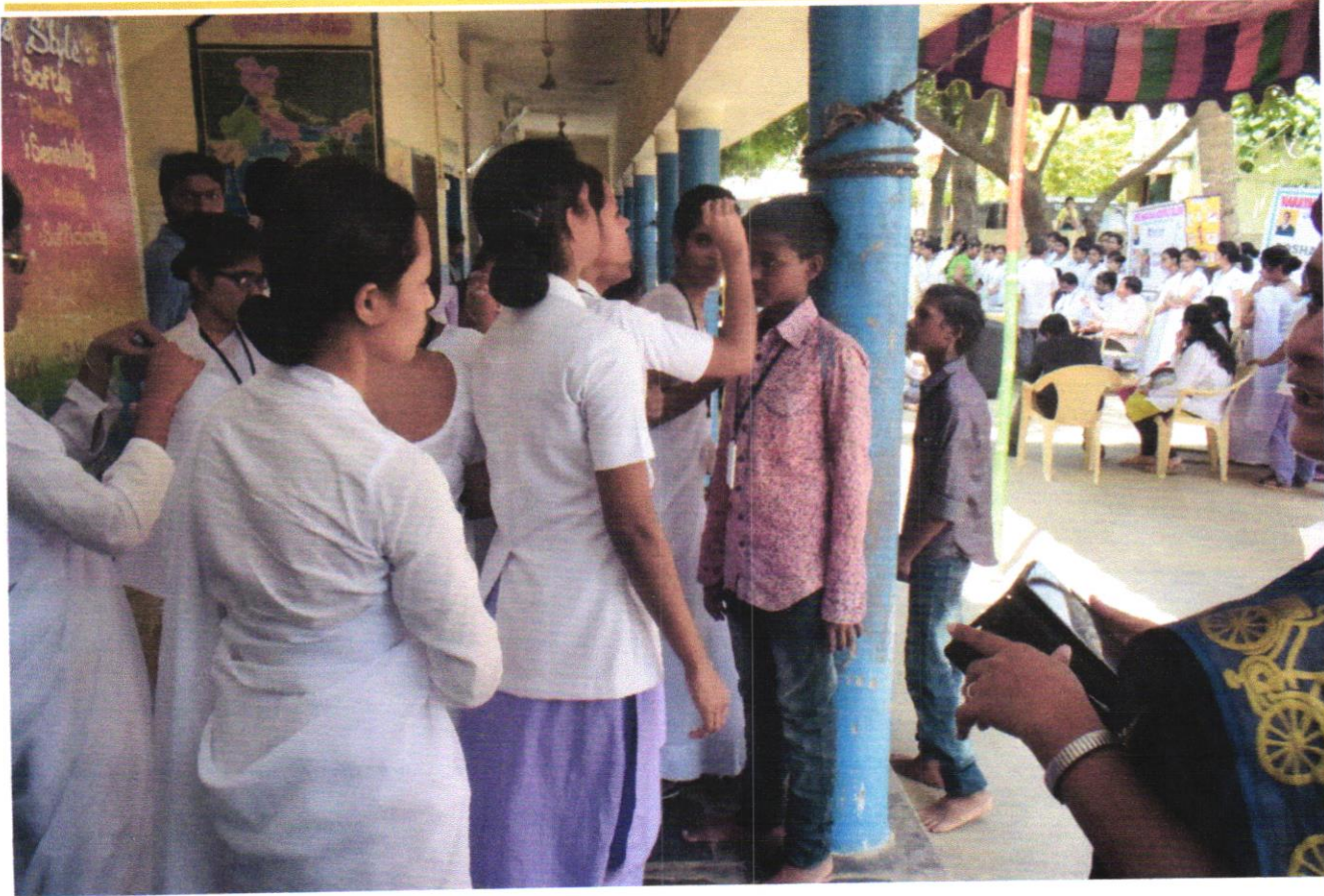
School health programme