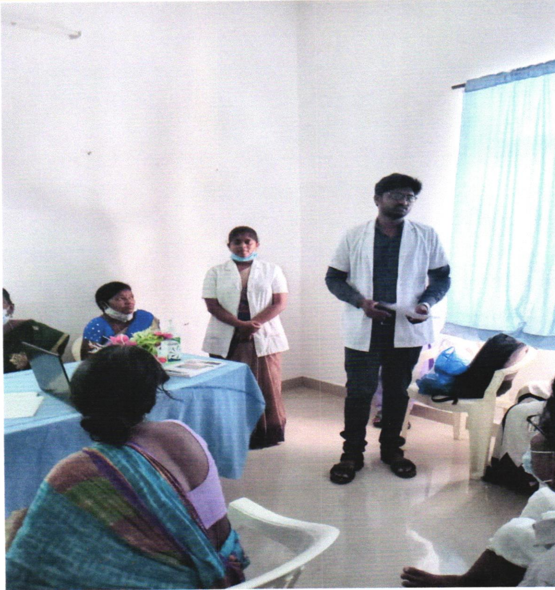
AWARENESS ON LIFE STYLE MODIFICATION