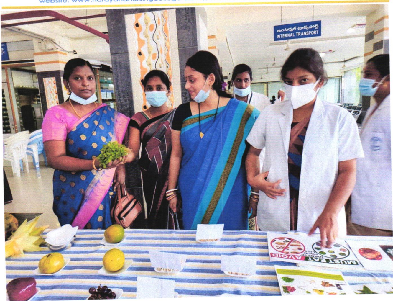
Awareness programme on diabetic diet