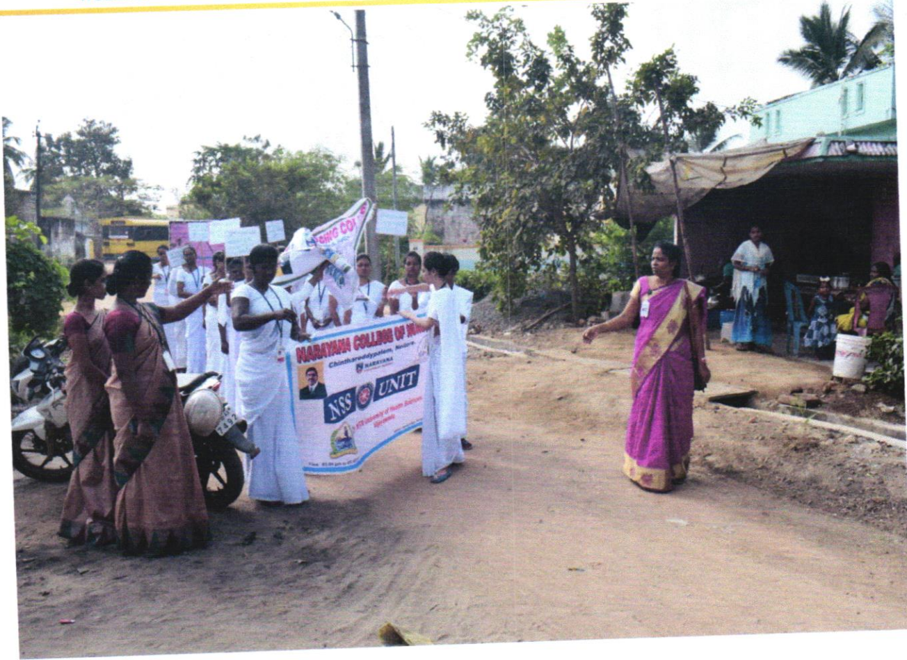
Health awareness rally